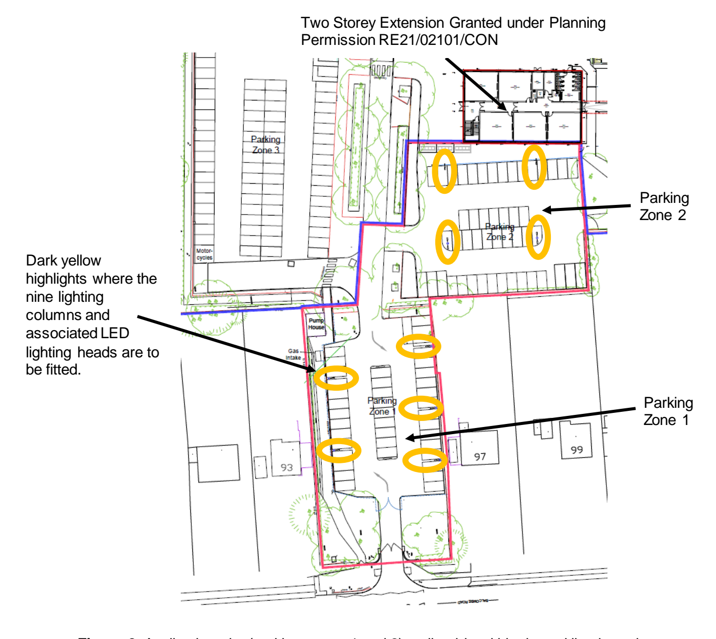
Figure 2: Application site (parking zones 1 and 2) outlined in within the red line boundary.